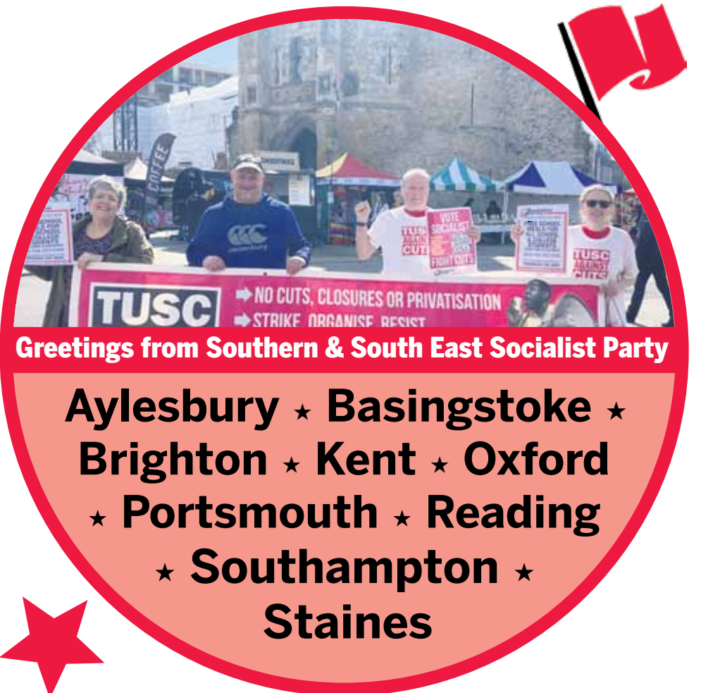
Greetings from Southern & South East Socialist Party

sends greetings and solidarity to struggling workers locally and all over the world